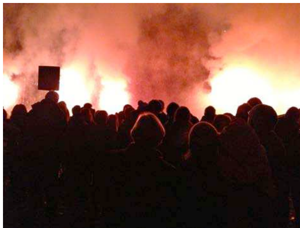
Wellow School's "Super Heroes" Fireworks