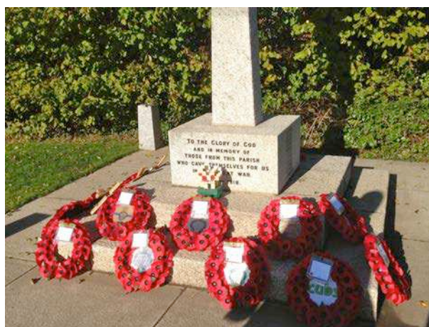
Remembrance Sunday Parade

The Wellow and District Royal British Legion Poppy Appeal ( this includes the parish of Wellow plus Plaitford and Nomasland) has raised £4,245.44 to date. This amount was raised by house to house collections, static collections in shops and other businesses and the Royal