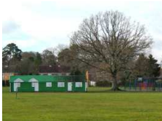
The existing 1930's Pavilion and the big oak!

The 1930's building has reached the end of its useful life and we received a structural report that made it clear that renovation was not a sensible option.